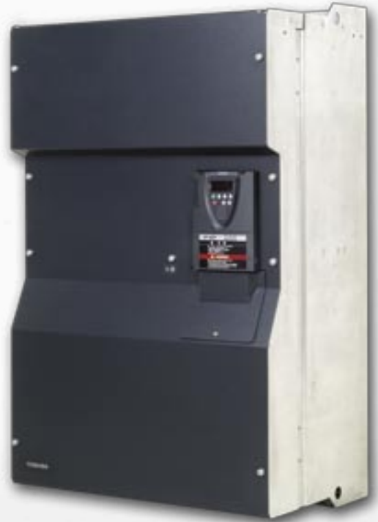
Large Horsepower AS1

The AS1 is certified by a broad range of governing and regulatory bodies making it a truly global product.