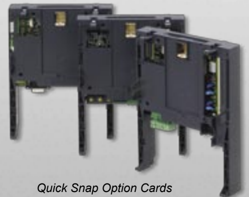
Quick Snap Option Cards

The AS1's new PID algorithm makes it easier than ever to dial in your process control application. New parameters, such as a delay filter and a process control lower limit, and new functions, such as the AS1's new Speed PID and easy positioning algorithms, give the drive expanded capabilities to take on difficult applications.