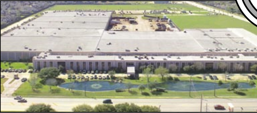
North America Headquarters & Manufacturing Facilities (Houston, TX)